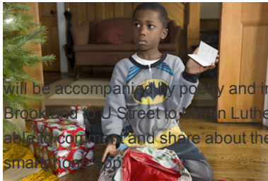
exhibit as also reflective of recent federal policy initiatives to educate and inspire young black men. The images will be accompanied by poetry and installed on buildings across the city, from Brookland to U Street to Martin Luther King, Jr. Drive in Southeast. Viewers will be able to comment and share about the exhibit on social media through a smartphone app.